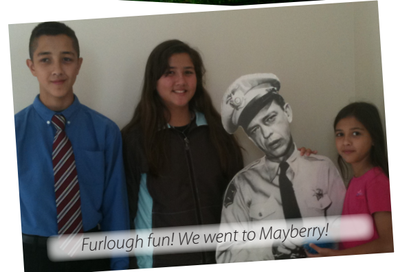
Furlough fun! We went to Mayberry!