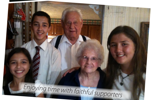
Enjoying time with faithful supporters