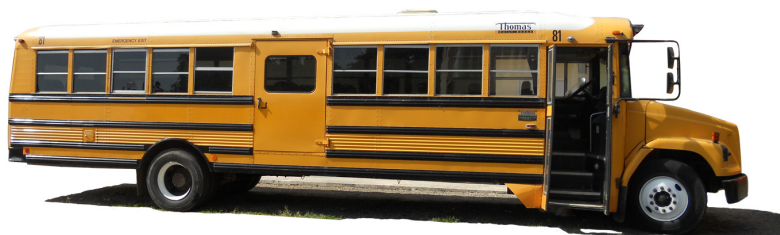
Please pray for our buses