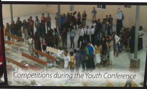
Competitions during the Youth Conference