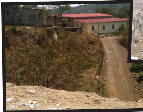
The newly leveled property (top), the seminary men building retaining walls (middle) and the road connecting the two properties (bottom)