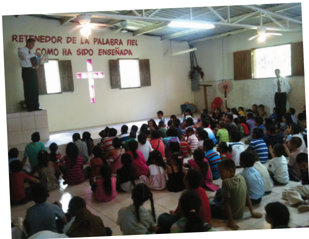
Children's church on Children's Day

always a big day. In October, we will be having a wedding for two of the singles in our church as well as hosting a Ladies Conference with 40-year veteran missionary Margret Stringer.