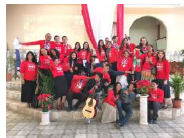
Teens at our camp!