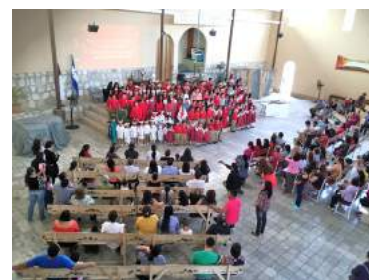
Christmas play in our school.