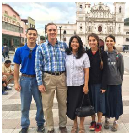
Our family was all together for Christmas.