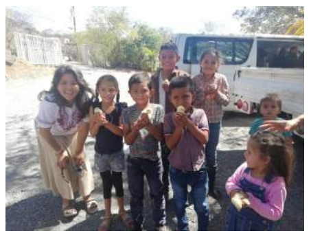
On Farmer's Day we gave 150 live chicks!